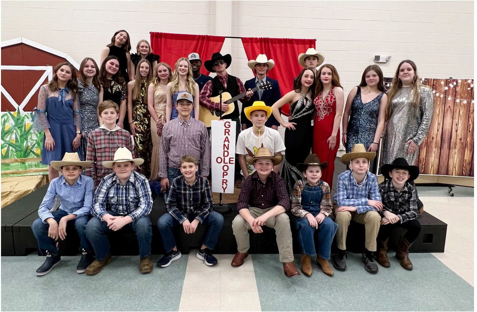
The First Baptist Youth Performers

As winter gives way to spring, what do we need to do so that our hearts are ready to receive the seeds Jesus will plant in us this year? What do we need to do so that our hearts bear the fruit of the Spirit just in time for the harvest? As the Lenten season arrives, what can we do now in cultivating a receptive heart for faith to grow deeper within us.